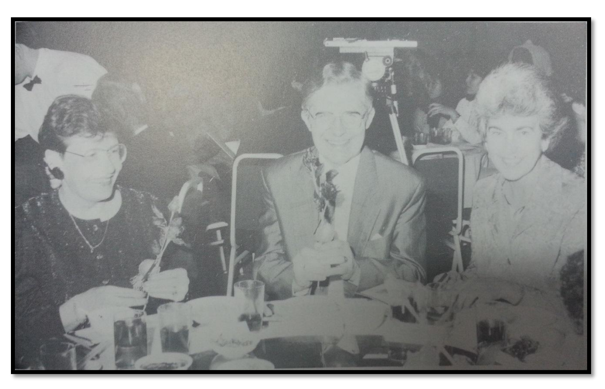
Amb as sadors\ who\ turned-up\ for\ the\ occasion.