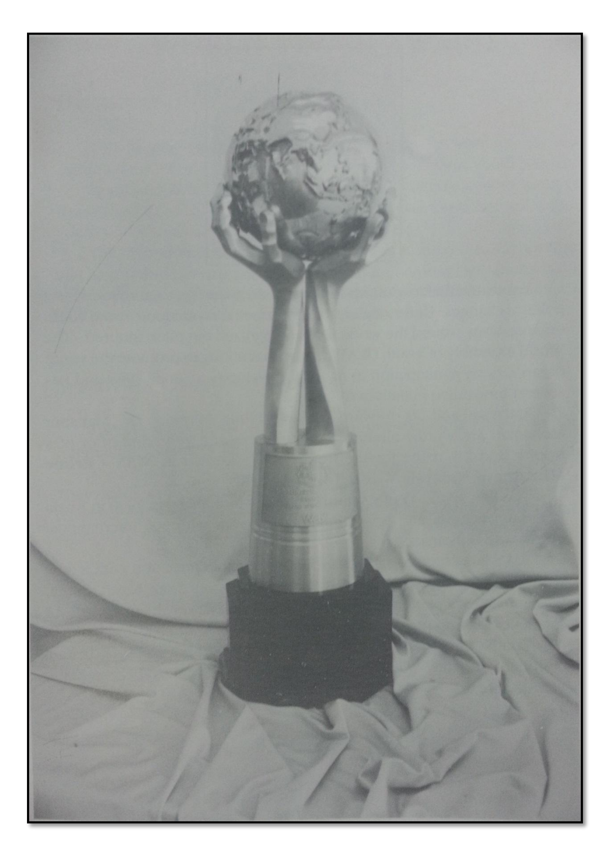
WAY – Prime Minister of Malaysia World Youth Award Trophy