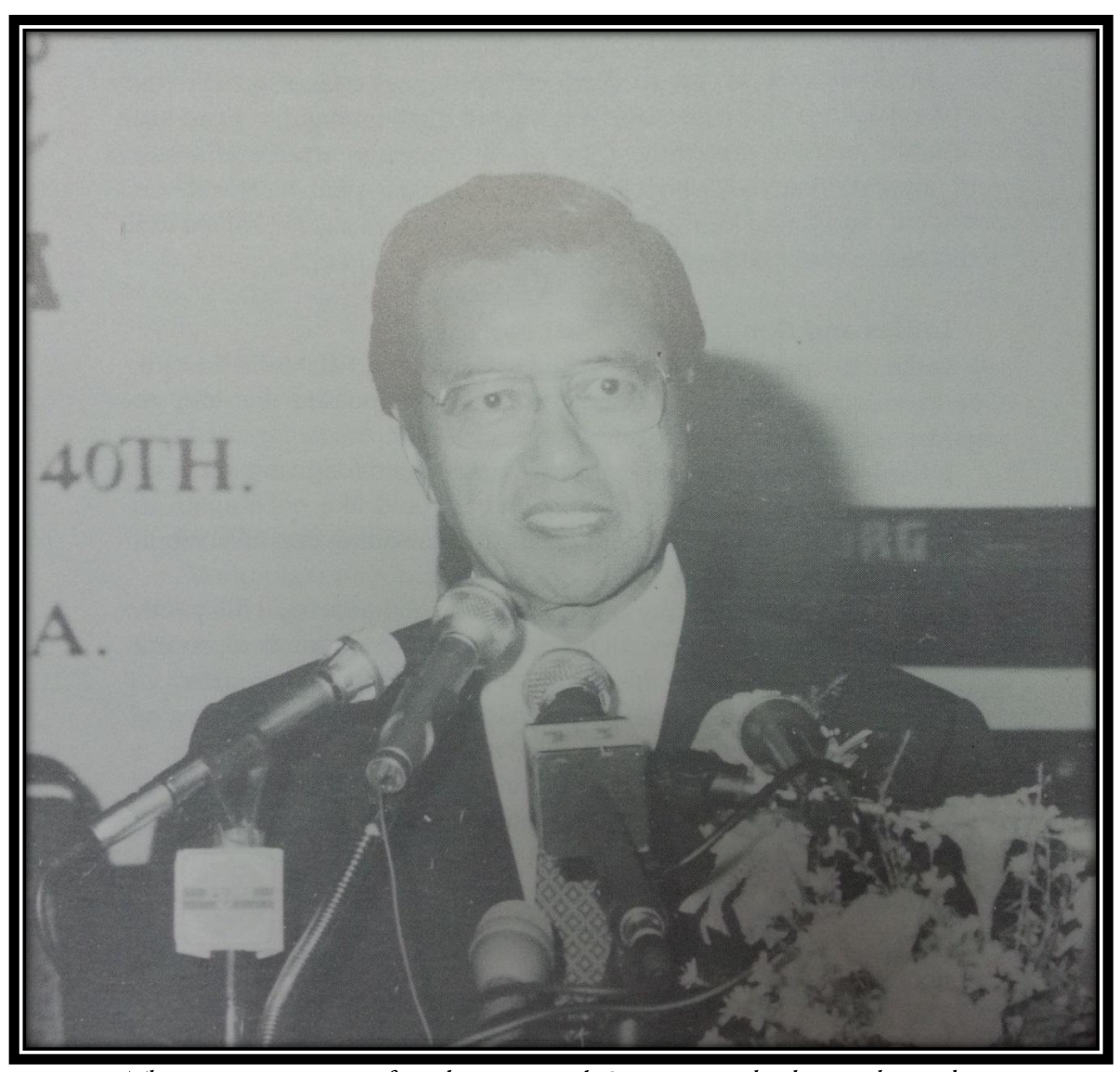
The Prime Minister of Malaysia Datuk Seri Dr. Mahathir Mohamad.