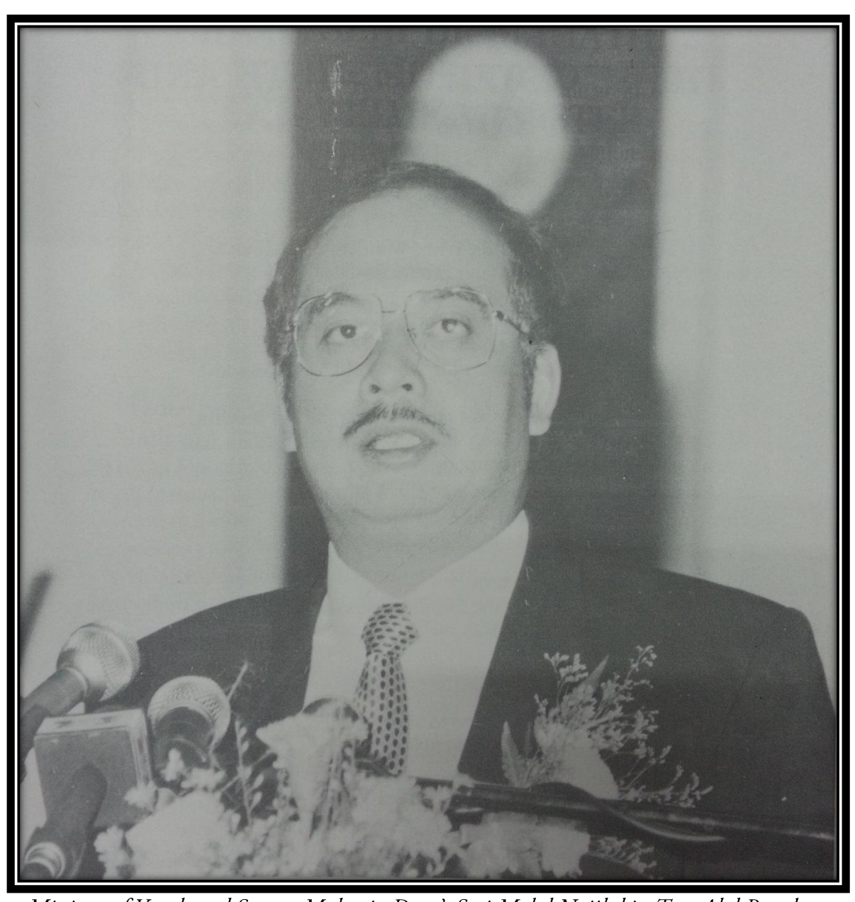
Minister of Youth and Sports, Malaysia Dato's Seri Mohd Najib bin Tun Abd Razak