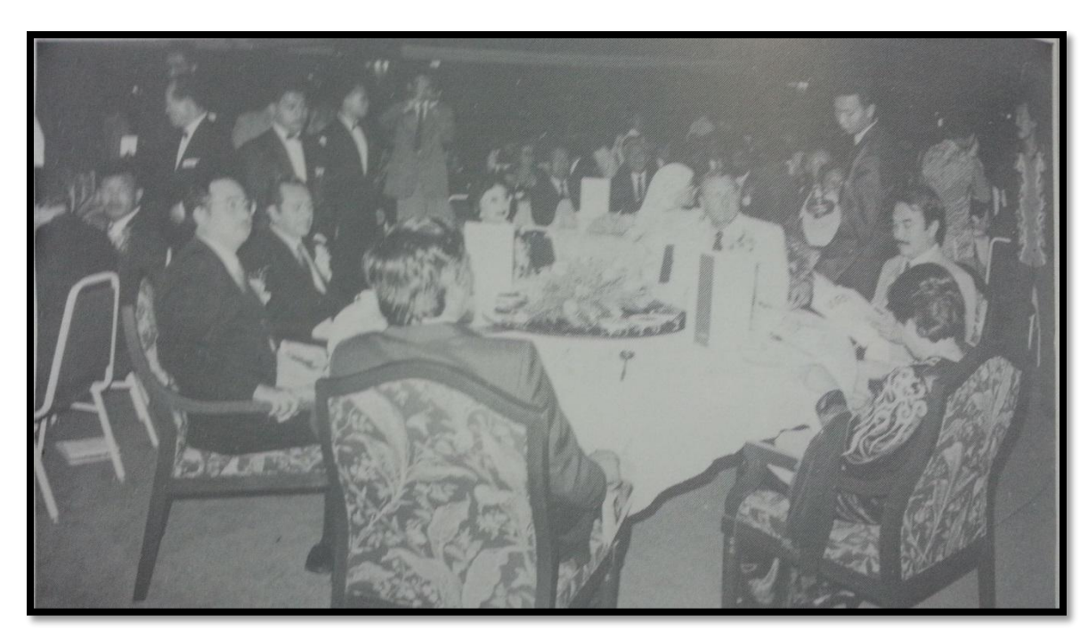
Guest-of-honour at the dinner table.