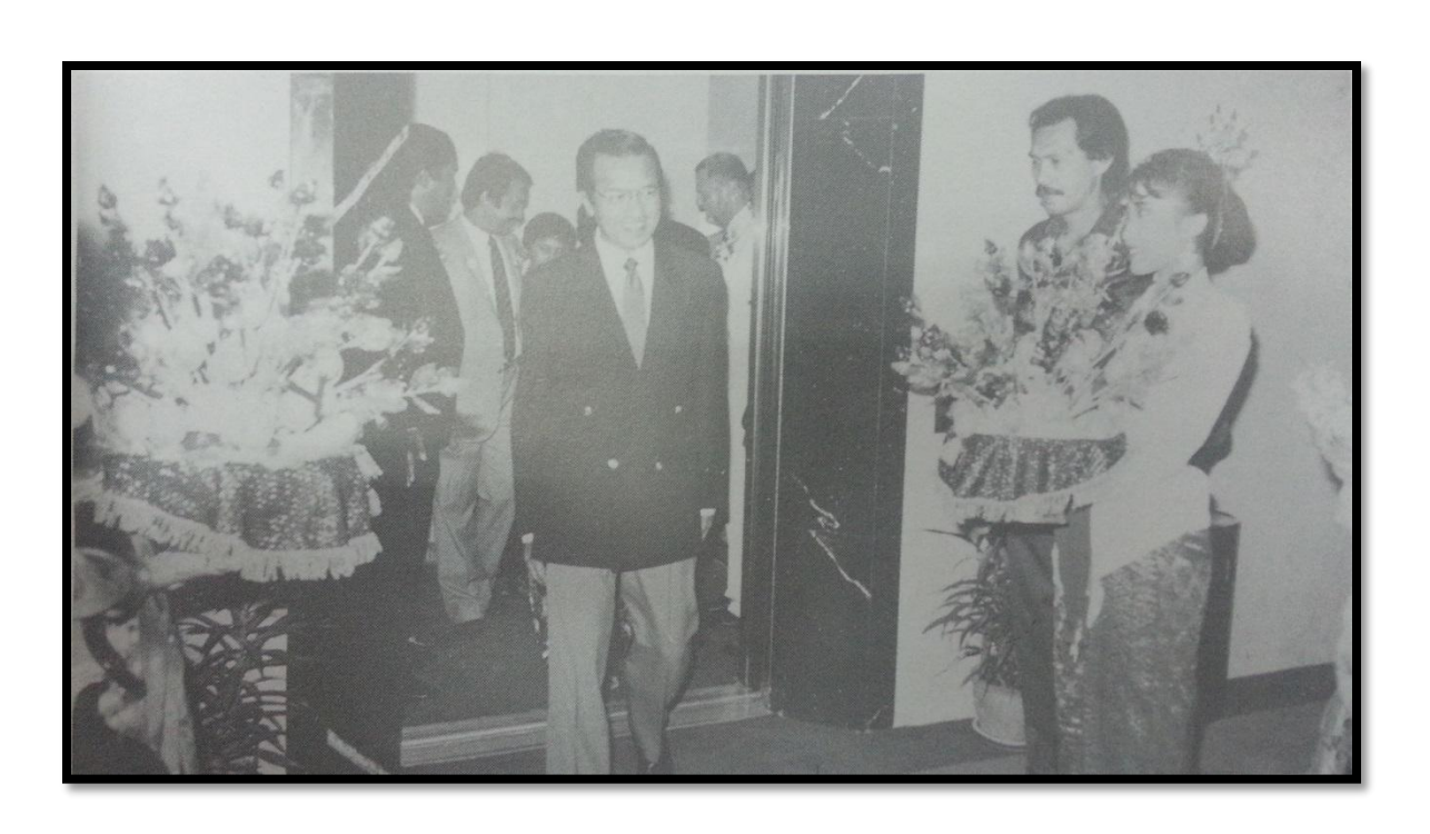
The Prime Minister of Malaysia the Right Honourable Datuk Seri Dr. Mahathir Mohamad being greeted with traditional "Bunga Telur" on his arrival at Subang Villa, Kuala Lumpur.