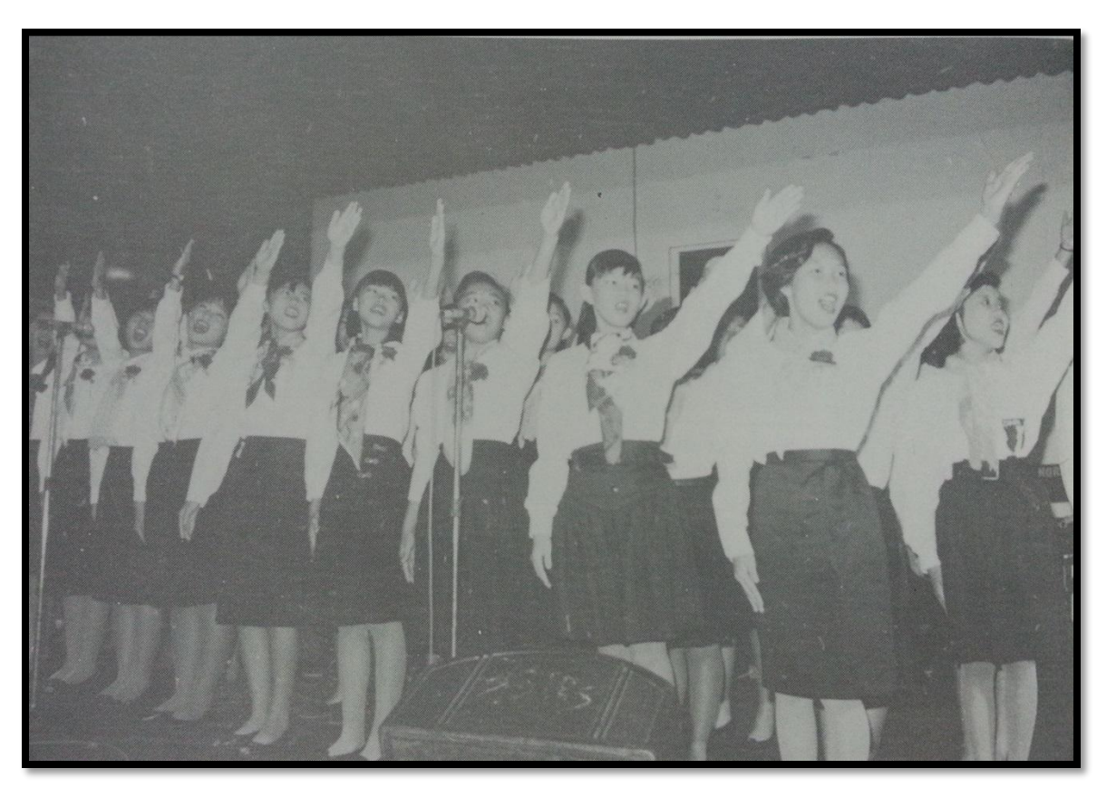
Choir from Sekolah Rendah Subang Jaya singing 'We Are The World'.