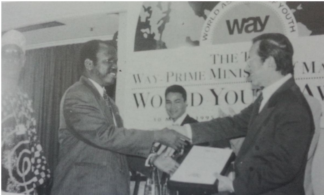
The Nigerian Youth Council , receiving the award for the Second runner – up of way – Prime Minister of Malaysia World Youth Award.