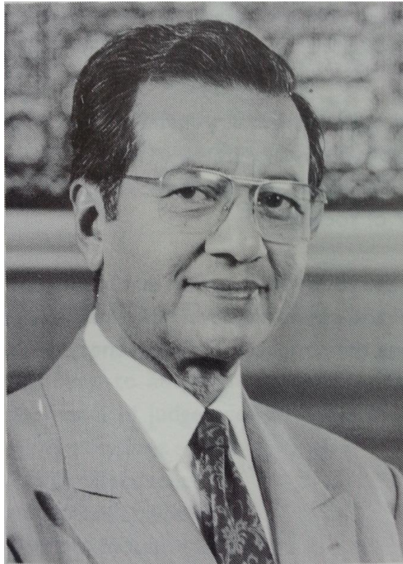
The Rt Hon Datuk Seri Dr. Mahathir Mohamad THE PRIME MINISTER OF MALAYSIA

“I Hope that this award will be a motivation to youth to develop values which ultimately will contribute towards the betterment of the world”