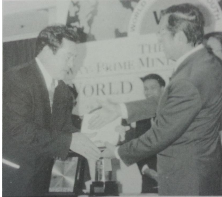
The First Runner – up of the 3 rd WAY – Prime Minister of Malaysia World Youth Award Mongolian Federation of Youth Movement receiving the trophy during the award presentation ceremony in Copenhagen.