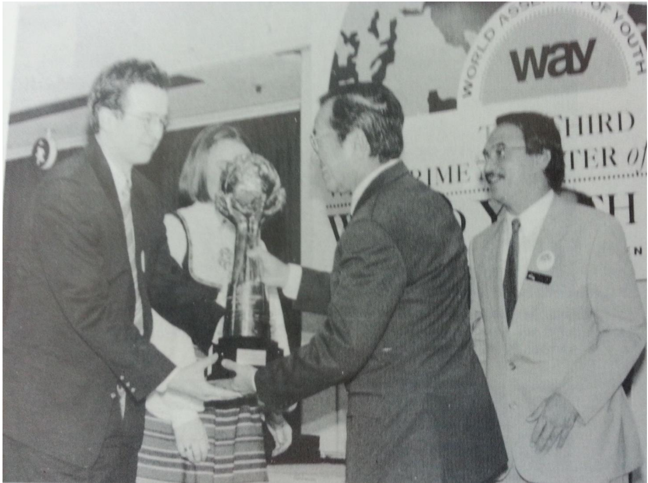
Winner – Norwegian Youth Council received the 3 rd WAY Prime Minister of Malaysia World Youth Award from the Hon. Datuk Seri Mahathir Mohamad in the ceremony held in Copenhagen in 1995.