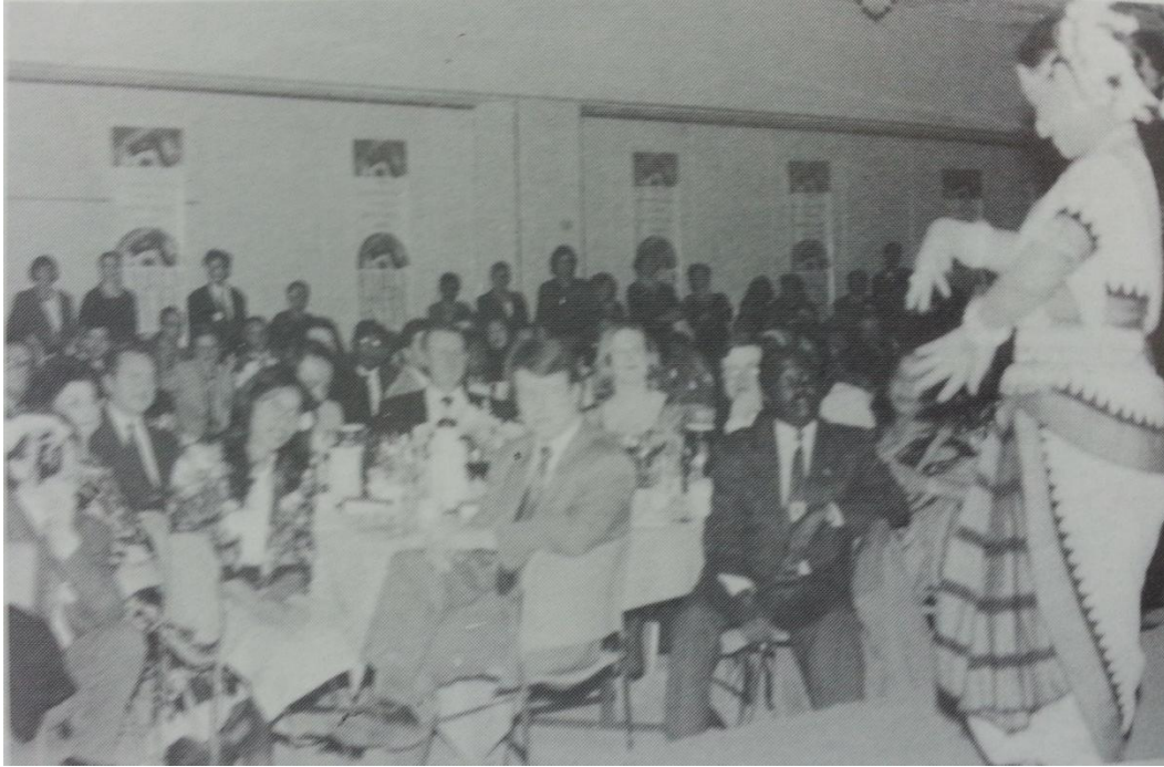
VIP's and guess enjoy a cultural performance at a dinner held in conjunction with the award ceremony.