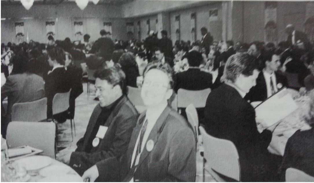
Among the guests at the 3 rd Way Prime Minister of Malaysia World Youth Award Ceremony in Copenhagen in 1995.