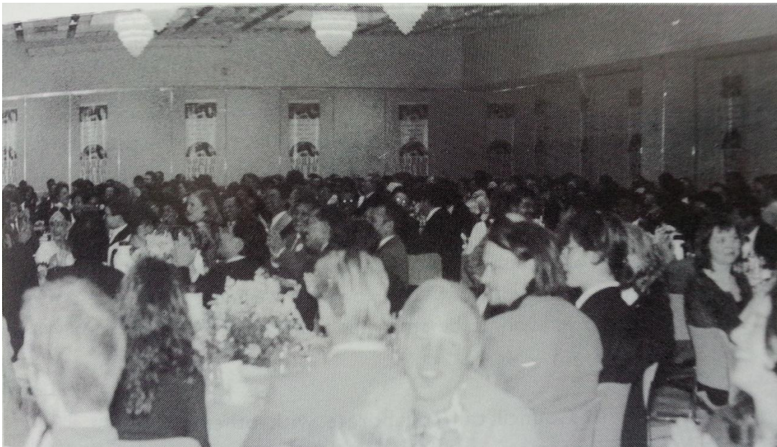
A round of applause ..... some of the guests at the 3 rd WAY Prime Minister of Malaysia World Youth Award acknowledging the contribution by award recipients.