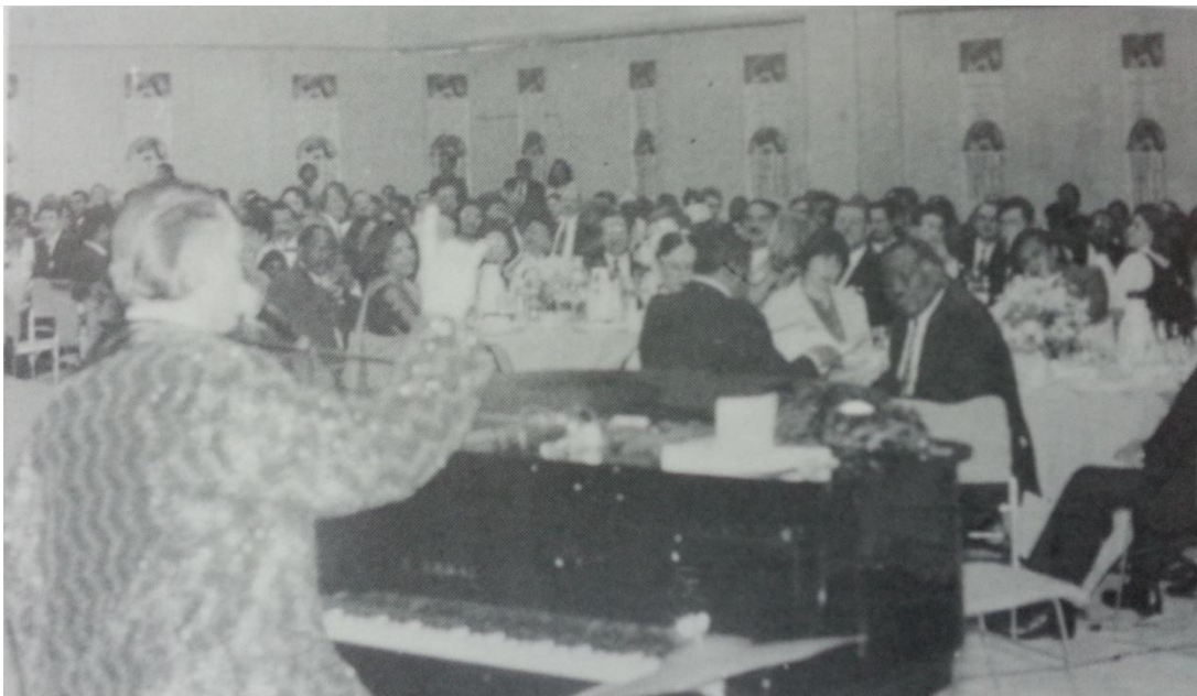
A piano recital by a musician added to the merriment at the dinner.